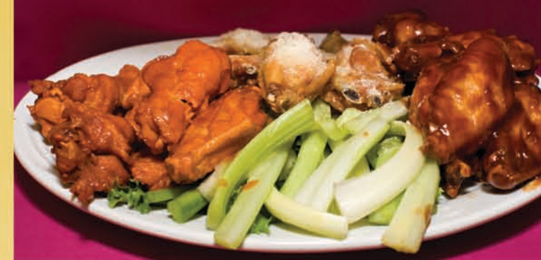
Bridges' Famous Jumbo Wings