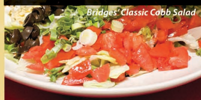
Bridges' Classic Cobb Salad

SOUP OF THE DAY .....Cup $2.99 .....Bowl $3.99